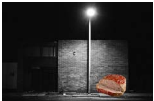
Above Right: Meatloaf unsuccessfully hiding somewhere in the night.