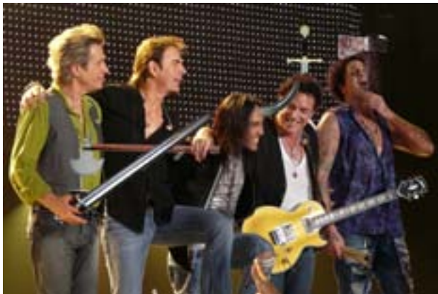
Above: Journey prepares to take the stage in an all-out Highlander-style battle-royal - for the jukebox, that is.