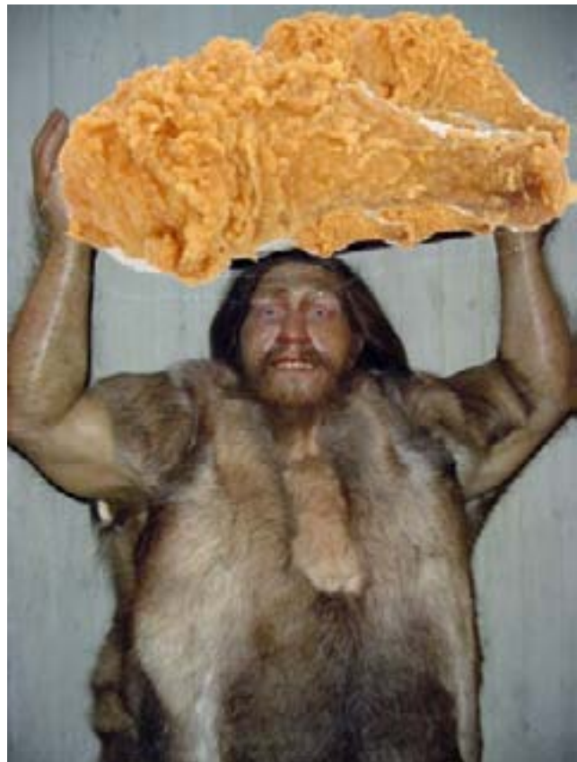
Above: One Case Carnivore demonstrates what it means to be a real meat-eating human.

In spite of all the counter-counter culture, the vegan organizations have responded to lack of cafeteria options by staging sit-ins and hunger fasts, which have lasted for as long as two grueling hours. Other forms of protest have ranged from whining to PETA to converting to hipsterism. The cafeteria staff has responded by simply not caring at all.