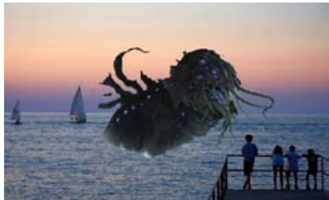
Above: The Lake Erie, moments before his career-high haunt vs. the Utah Woodsmen

While the controversy settles around LEM’s decision, many still bemoan the blatant disruption of balance-of-power in the NLEC. Others are still just pissed about Lebron.