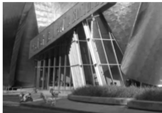
Confused Family of Squirrels at PBL

Investigations are on-going. CWRU Security released a statement for students to keep a watch for people sneaking the potent substance onto campus grounds. They also recommend staying in safe places at night, like in front of your computer. Any form of social interaction could spread the menace of Happy, or even worse, encouraging a social atmosphere about campus.