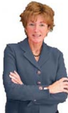
Babs demonstrates the dangers of anvils.

people get squashed flat like a pancake, but they recover within a couple of minutes, no harm done!" He continued on, but we weren't paying attention. It was at that point that a large anvil-shaped shadow began appearing around us, and despite our attempts to flee, we were hit on the head and driven into the ground like a nail. By the time we worked ourselves free, the rabbit was gone. Thus the interview quickly concluded.