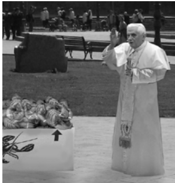
Above: Pope Condemns evils of lobster.

But the Pope was steadfast in his convictions. “If we allow Catholics to eat shellfish, even though it is forbidden by God, then what’s next? I suppose you’re going to try to tell me that it’s possible for two people of the same gender to have a loving, consensual relationship with each other too.”